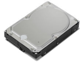
4TB Enterprise HDD