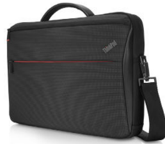
ThinkPad 14-inch Professional Slim Topload