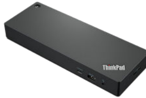
ThinkPad Universal Thunderbolt™ 4 Dock